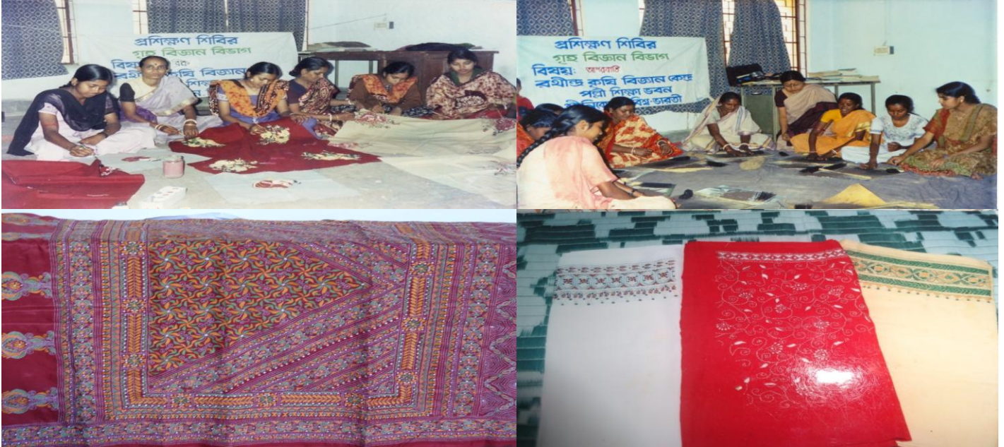
Skill Development Training Programme on Tie and Dye ( Bandhni ) organized by Rathindra KVK, Birbhum