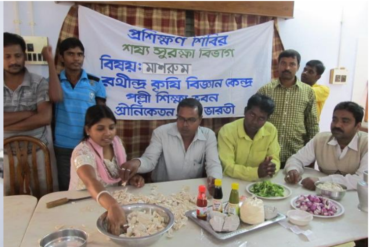
Training on value addition of Mushroom organized by Rathindra KVK, Birbhum, West Bengal